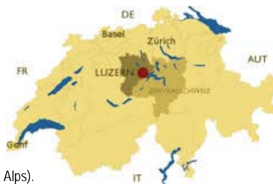
Lucerne in the heart of Switzerland

Panel on sustainability as key factor for food security. Visit Farms and processing facilities.